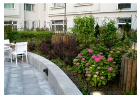
Curved planting beds with various small plants, shrubs and trees are built along the walkways.