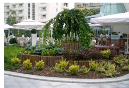
An integrated automatic irrigation system in the planting beds ensures adequate water supply of the plants.