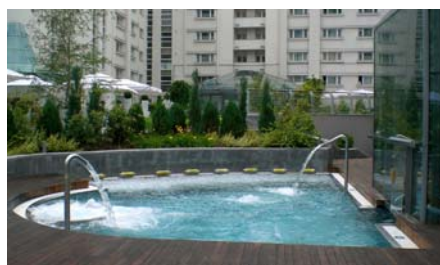
Europe's largest outdoor whirlpool is situated in the Radisson Hotel courtyard.