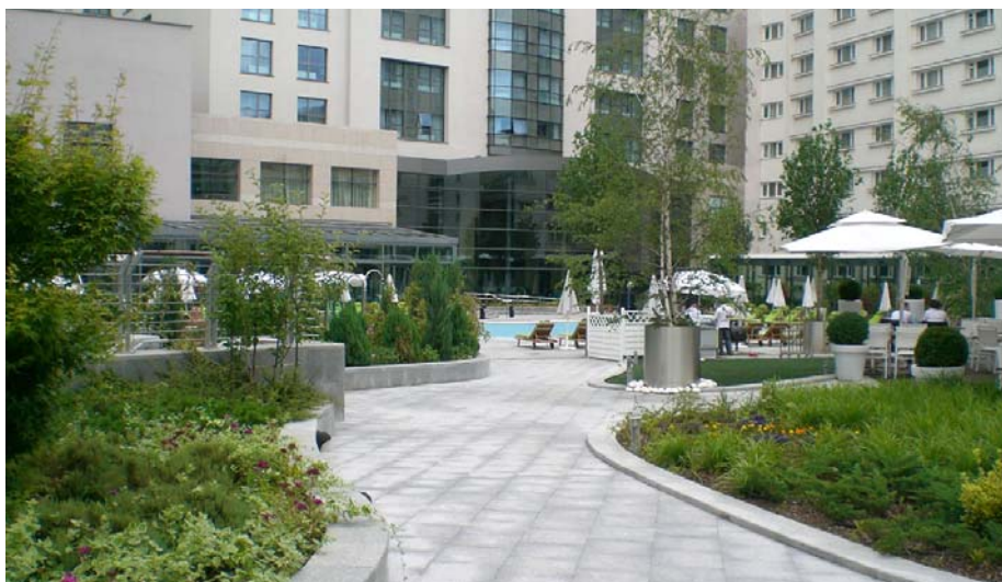
The green outdoor area of the hotel contributes to a pleasant stay of the guests.