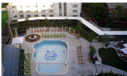
The heated outdoor swimming pool is located on the underground parking garage of the hotel.