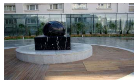
A water feature contributes to ease and relaxation of the guests.